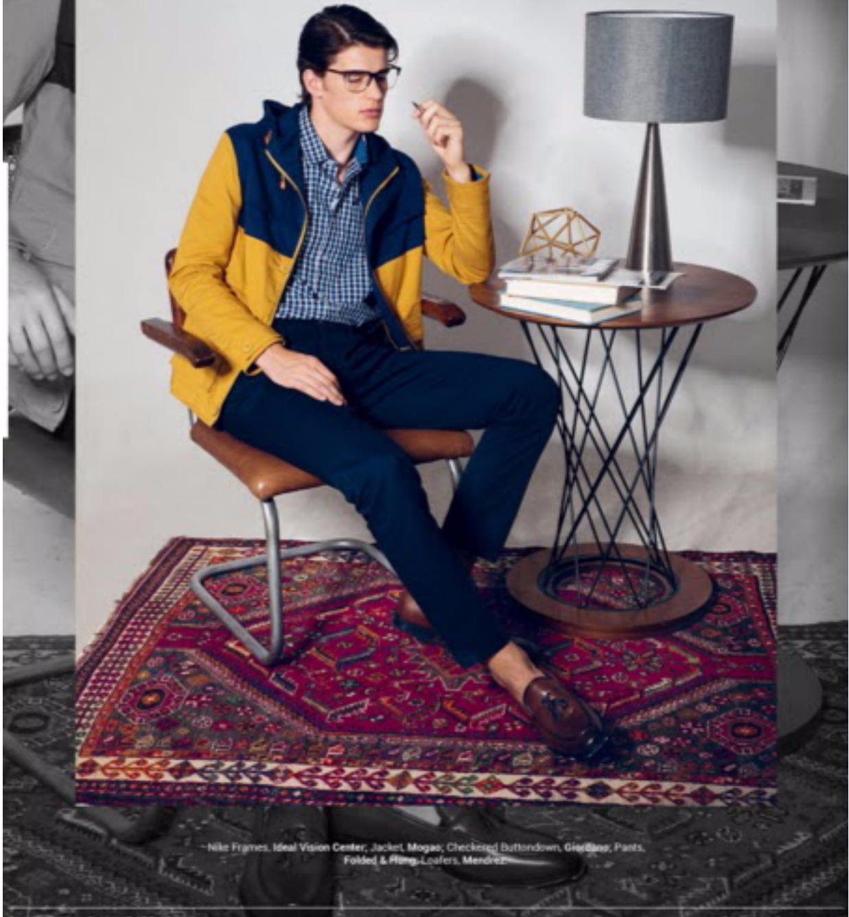
Nike Frames, Ideal Vision Center, Jacket, Mogas; Checkered Buttondown, GiorBao; Pants, Folded & Flung; Loafers, Mendrez

Architects walk between the worlds of design and business. How to dress the part? In classic separates that spell smart and casual cool